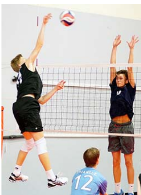
Carolina Region is FUN!