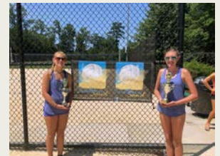
12U Team of Year