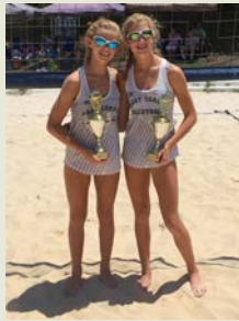
14U Team of Year