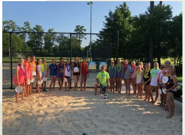
12's Group Shot