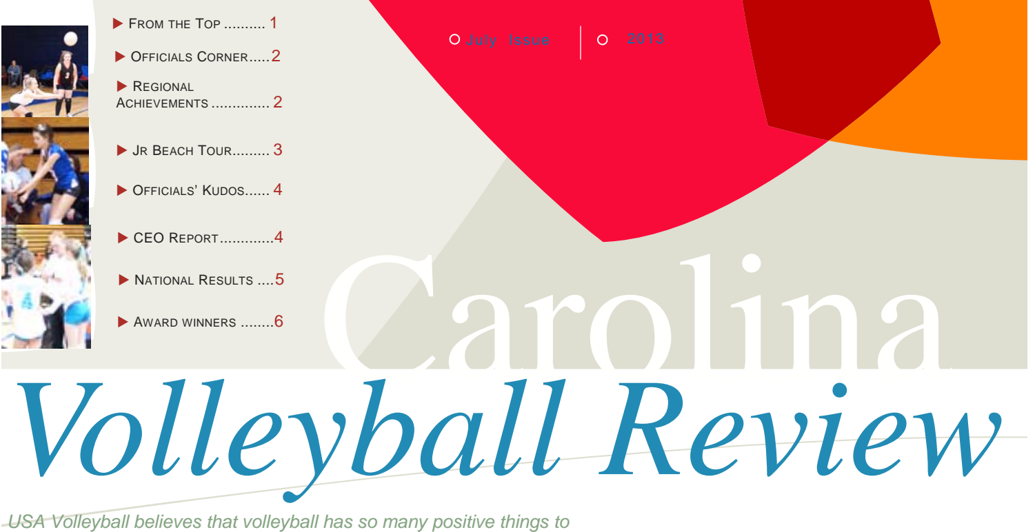
USA Volleyball believes that volleyball has so many positive things to offer those who participate. First, and most importantly, whether one is a gifted athlete or a recreational player, volleyball is FUN!