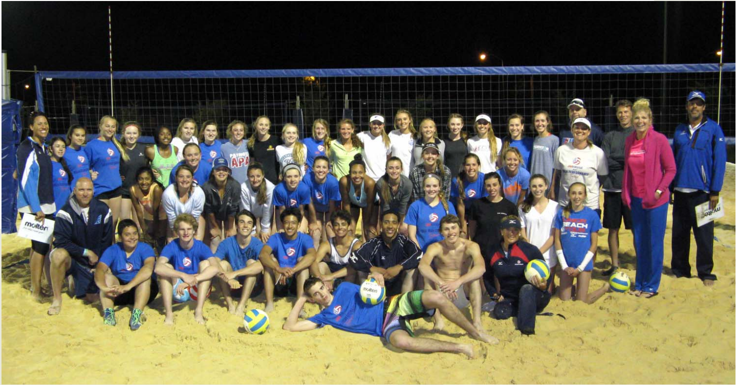
USA Volleyball Beach High Performance Tryout Participants April 25, 2015—Apex, NC