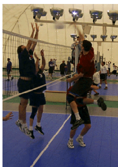
Carolina Region is FUN!