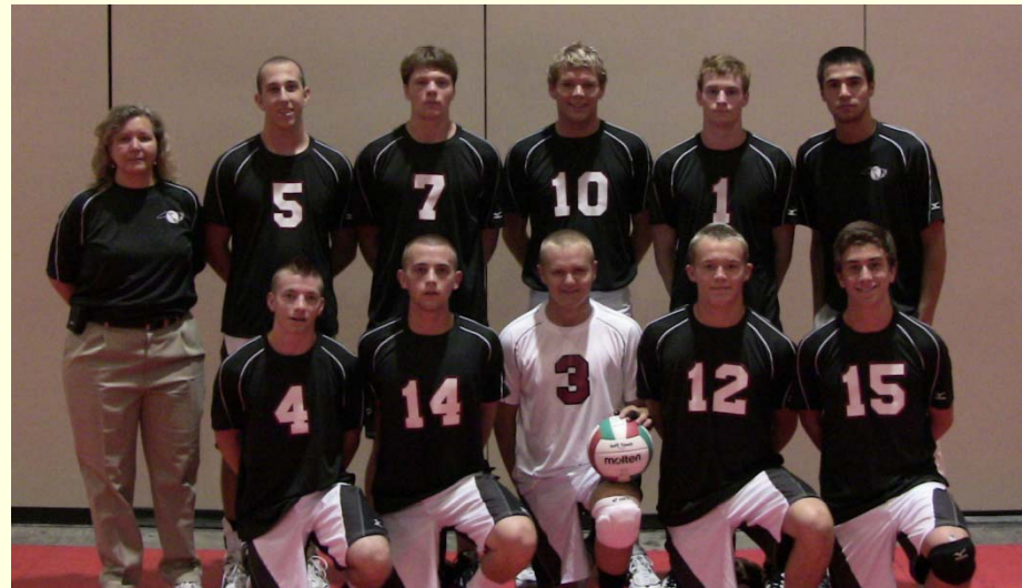
2009 Carolina Region Boys HP Team